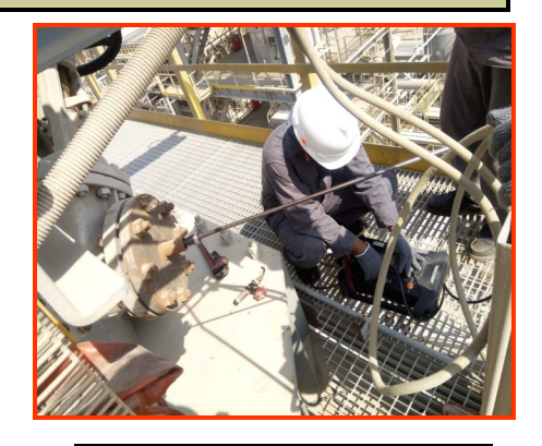
Stack Emission Testing